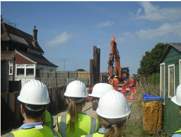
Pupils from Buckingham Park Primary watching piling at W3

The visit includes a guided tour of the construction work and a workshop on flooding to tie in with the school curriculum.