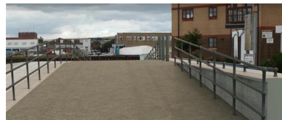
Visualization raised slipway at Emerald Quay

The slipway at Emerald Quay is to be raised so that the top of the slipway is at flood defence level (see image from visualization below). This work started in May and is expected to be finished in August. The slipway will be closed for the duration of this work.